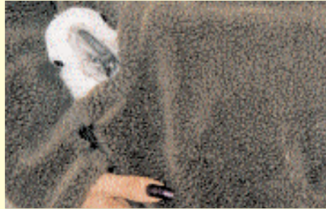
Before Birdcare supplements Holly was impossible to handle. Now she loves a cuddle!

Another reason for lethargy and depression can be a simple B group vitamin deficiency (the